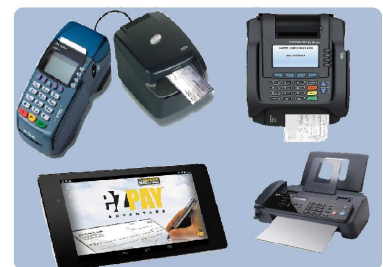
SIMPLIFIED USER INTERFACE