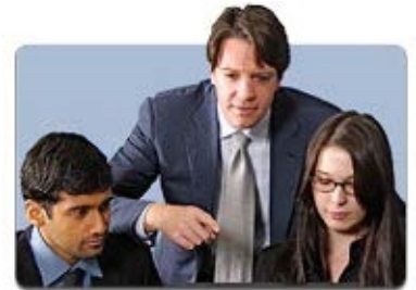
UNIQUE CUSTOMER FINANCING