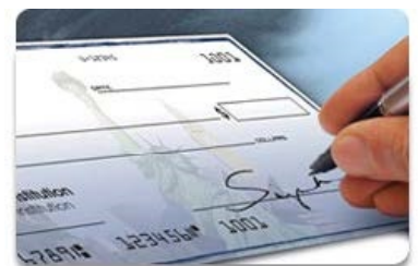
SIMPLIFIED CHECK PROCESS