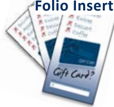
Restaurant Folio Insert