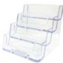
Tiered Card Holders