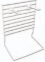
Wire Hanger Display