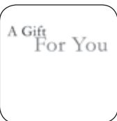
Generic Gift Card Holders